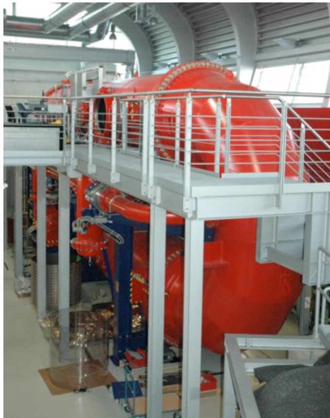
Figure 1. The Variable Density Turbulence at the Max Planck Institute for Dynamics and Self-Organization.

The Variable Density Turbulence Tunnel[2] is a pressurizable wind tunnel that can use both air and sulfur-hexafluoride as working gases. By setting the pressure of the gas to anywhere between 0.5 and 15 bar it is possible to set the Reynolds number, Re = UM/\nu , to values between 10^4 and 5 \cdot 10^6 . Changing the pressure changes the kinematic viscosity, \nu . Here U is the mean speed of the flow, M the mesh spacing of the turbulence-producing classical grid. All the physical boundary conditions like grid size and shape, as well as the mean speed of the flow, remained constant throughout the experiments used in this study in order to focus solely on Reynolds number effects. To measure the rate of decay, we used a linear traverse to position hot wire probes of different distances downstream of the grid. Among the probes we used were the NSTAPs (nano-scaled thermal anemometry probes) developed at Princeton University [1], which are able to resolve all scales of the turbulent motion. We measured decay rates at about 40 different Reynolds numbers to get precise information about it's effect on the decay rate.